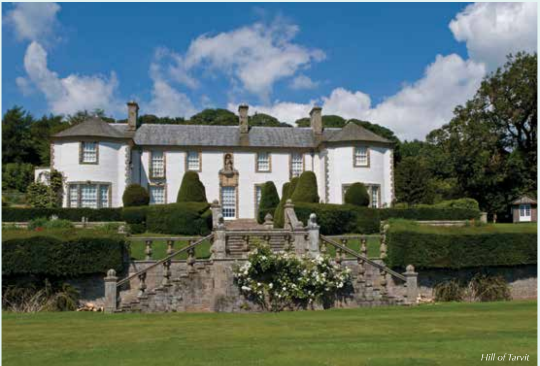
Hill of Tarvit

For attractions in GLASGOW, WEST HIGHLANDS and the SOUTH-WEST SCOTLAND, see In and Around Glasgow and Day trips from Glasgow