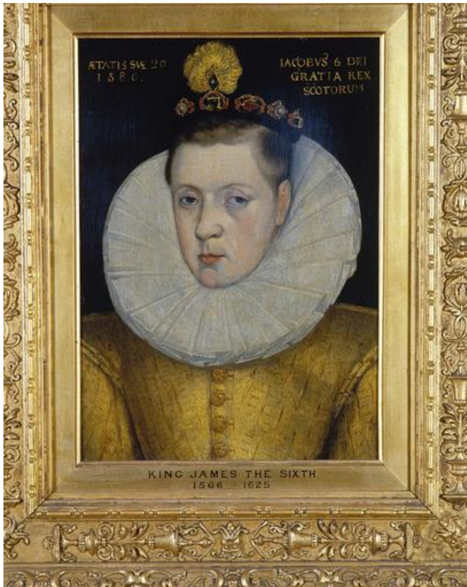
James VI (1566 – 1625))