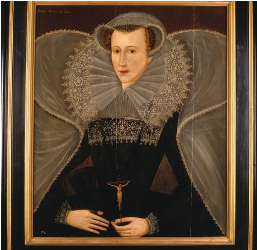
Mary Queen of Scots (1542-1587)