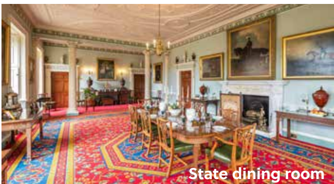
State dining room

Discover Culzean's masterful centrepiece, the sweeping Oval Staircase with its soaring colonnades and grand oil paintings, as well as the unique Round Drawing Room, which has panoramic views over the Firth of Clyde. The elegant rooms and exquisite Georgian interiors offer the ultimate setting for events of all shapes and sizes, where you can immerse your clients in the history of this amazing place and celebrate some of Scotland's great stories and traditions.