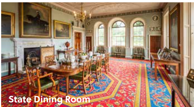
State Dining Room

Filming sessions were completed earlier in 2022 at the five locations across Scotland to bring guests a unique opportunity to join these great Scottish drink brands for an exclusive tasting experience with their brand ambassadors. The menu will celebrate the best of local Scottish produce and will change throughout the year to reflect seasonal availability, featuring both traditional recipes along with some contemporary ideas that showcase the diversity of Scotland's larder.